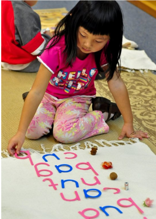
Building words with “movable alphabet”

High resolution photography available upon request. Please contact Monica LePort at mleport@leportschools.com