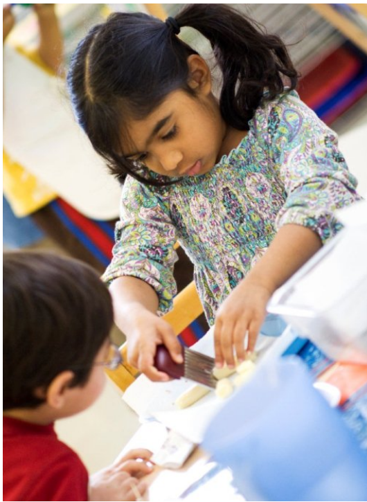
Learning to prepare food in “Practical Life Area”