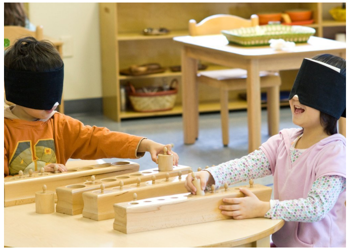
Learning about height, width with “cylinder insets”